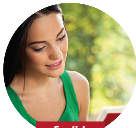
English for Life

Students from around the world have been learning English at CCEL since 1991. CCEL courses are approved by the New Zealand Qualifications Authority (NZQA) and CCEL has the highest possible NZQA quality rating.