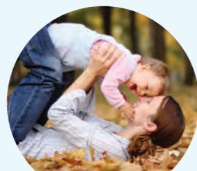
Au Pair Work Placement Programme