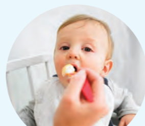
Early Childhood Placement Programme