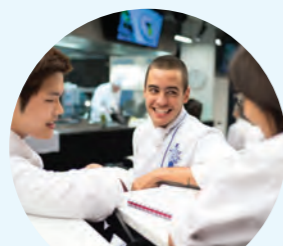
Job Search Programme

CCEL offers add-on programmes so students can make the most of their New Zealand experience.